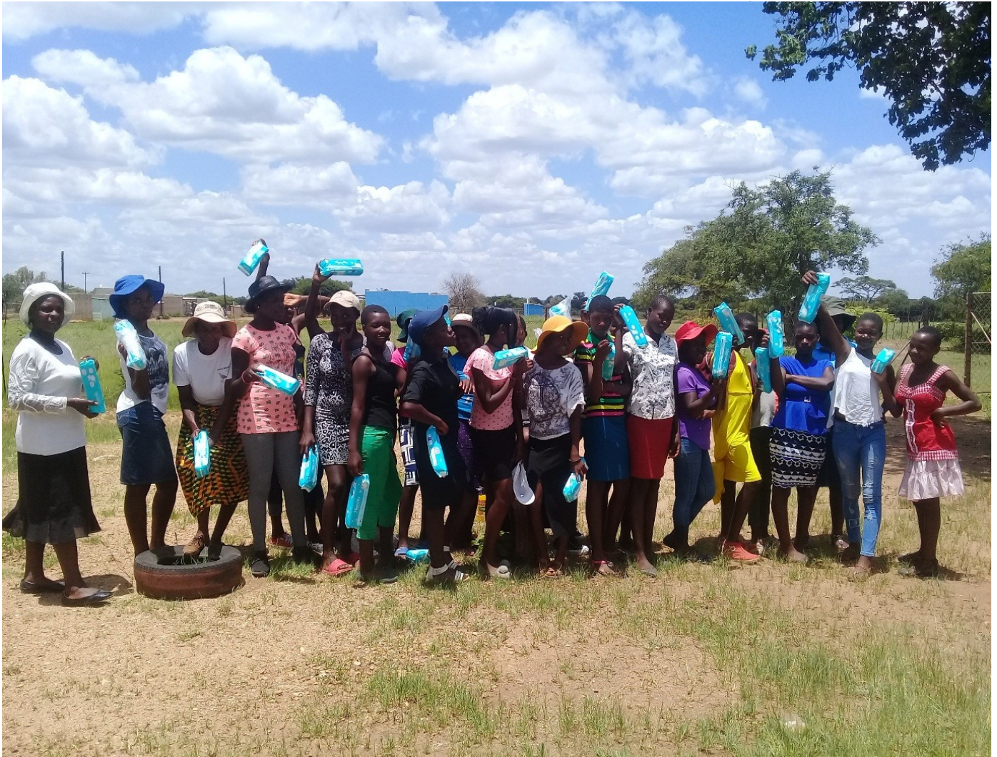
Fig. 3 left: White Angels Girls club receiving their sanitary wear (Bubi district). Right:

the picture shows the adolescents from White Angels Girls Club posing for a picture after receiving sanitary wear from Trinity Project in Bubi District.