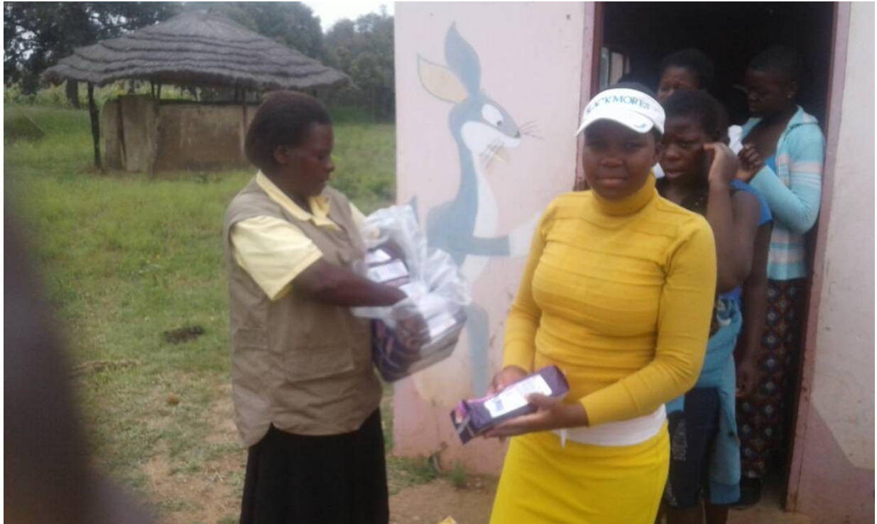
White Angels Club Mentor distributing sanitary wear to the vulnerable girls.

The organisation managed to distribute 185 sanitary wear to club members who are mainly orphans and unable to buy sanitary wear on their own. Reproductive health sessions were conducted, and these sessions concentrated on puberty, body hygiene, dating, early pregnancies and drug abuse. 60 sanitary wear has been distributed so far to 30 girls. The remainder of sanitary wear will be distributed in the next 4 months.